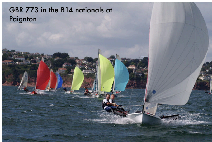
GBR 773 in the B14 nationals at Paignton

through all of the revisions and proved to offer excellent flexibility. Initially boat speed looked great when we married the final prototype mast with the LG main and so the decision was to leave the sails as they were and see how we got on.